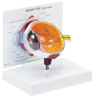
LFA #2750 Normal Eye