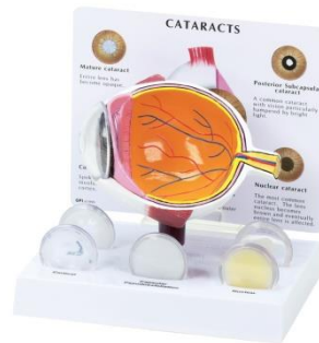
LFA #2800 Cataract Eye